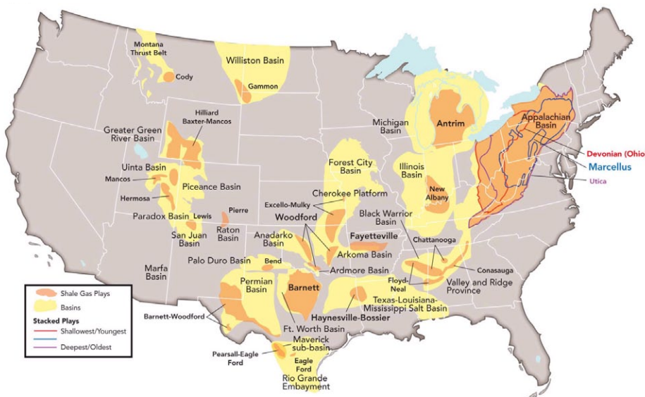
Information Administration based on data from various published studies. Updated March 2010.

Each individual contractor as well as the company in its entirety needs to be protected from such inevitable risks. Our key opportunities lie within the service equipment arena and the existing oil lease properties. This emerging industry is a great prospect for insurance agents to expand their current book of business and clientele.